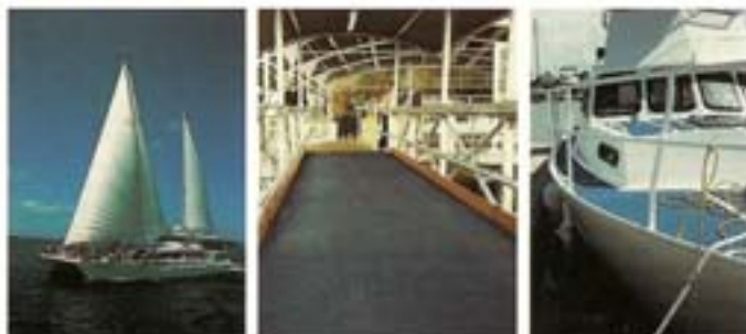
Marine Decking Wharves Jetties Pontoon Decking External Ramps Walk Ways