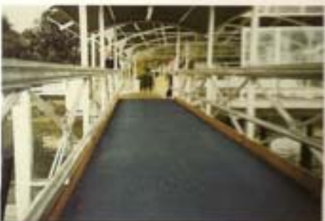
External Ramps Walk Ways