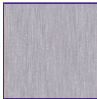
VQ-6 Digital Silver