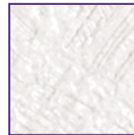
VQ-11 Digital Rembrandt Oil