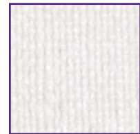
VQ-12 Digital Artisan Canvas