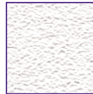
VQ-2 Digital Dapple