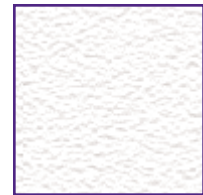
VQ-4 Digital Suede