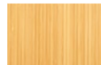
Vertical - Light Sand