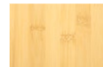
Horizontal - Light Sand