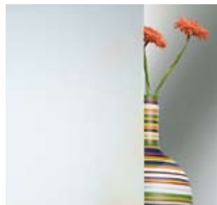
Stopsol Supersilver Clear