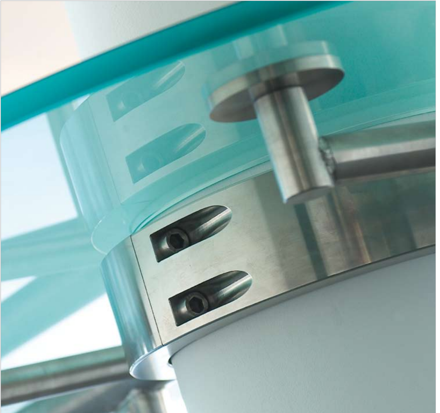
TABLE Matelux Linea Azzurra (van Dijken).