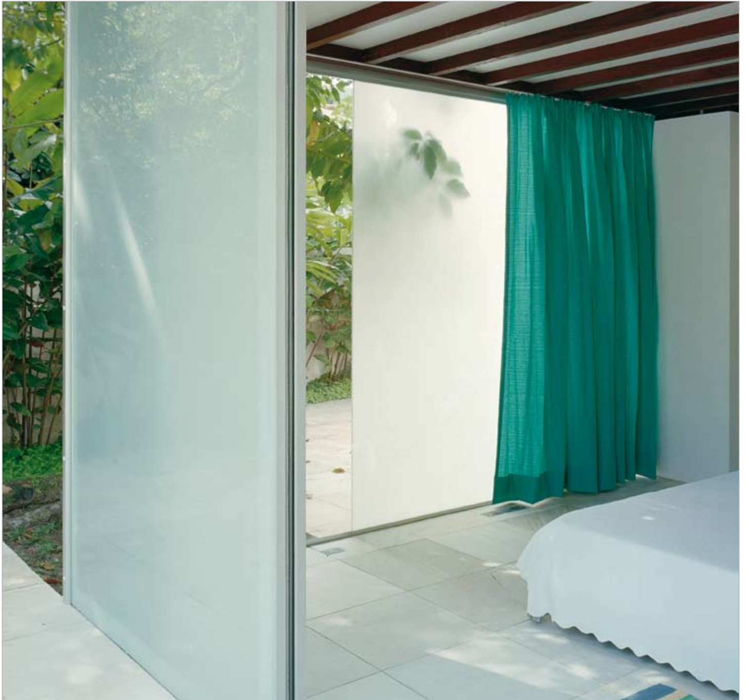
BAY WINDOW Private residence in Brazil (architecture Nitsche). Acid-etched MATELUX Clear laminated safety glass.