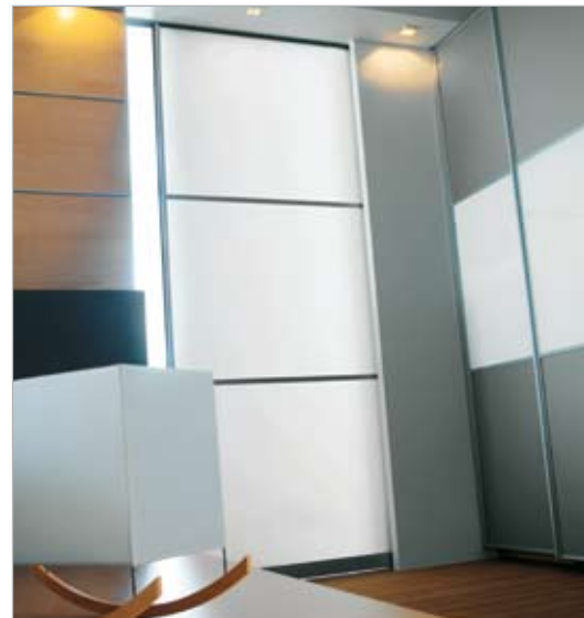
Partition made of MATELUX glass.

A laminated (safety) version of Matelux is also available with one or both sides frosted.