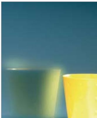
Matelux Stopsol Supersilver wet.