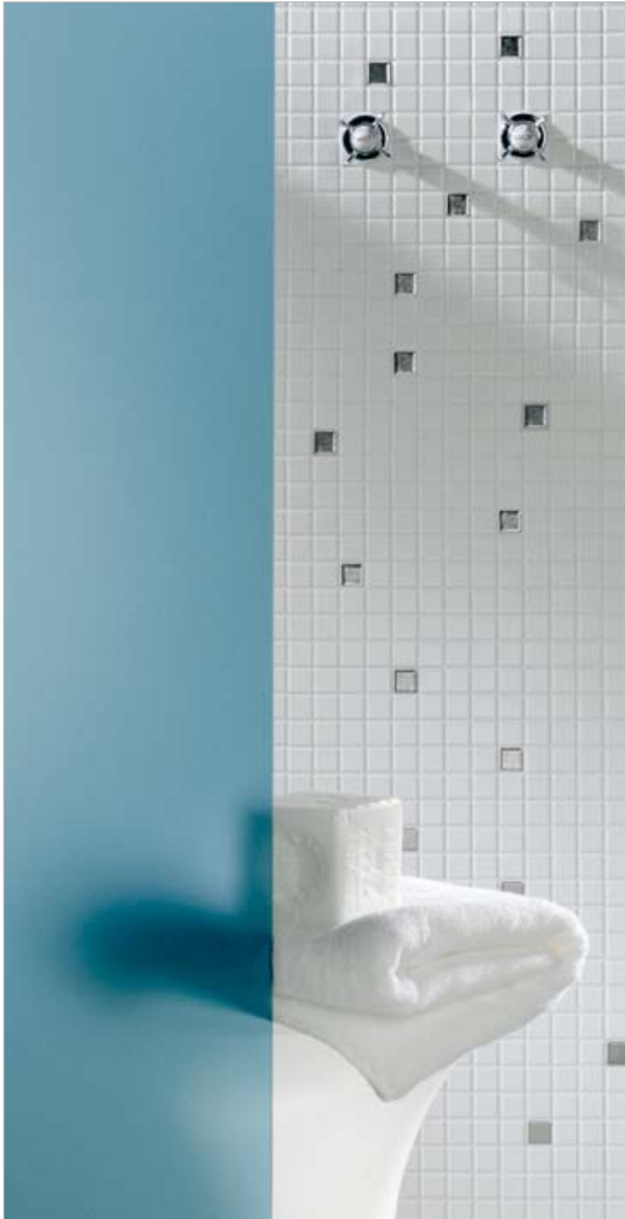
BATHROOM Shower screen made of MATELUX PrivaBlue.