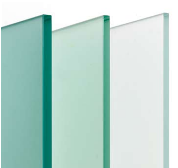
MATELUX Linea Azzurra, MATELUX Clear and MATELUX Clearvision, three clear satin-finish glasses, tinged blue, green and white, the effect being particularly striking at the edges.

A constant source of inspiration for designers, Matelux mirrors the current trend towards minimalism, simplicity and pure forms.