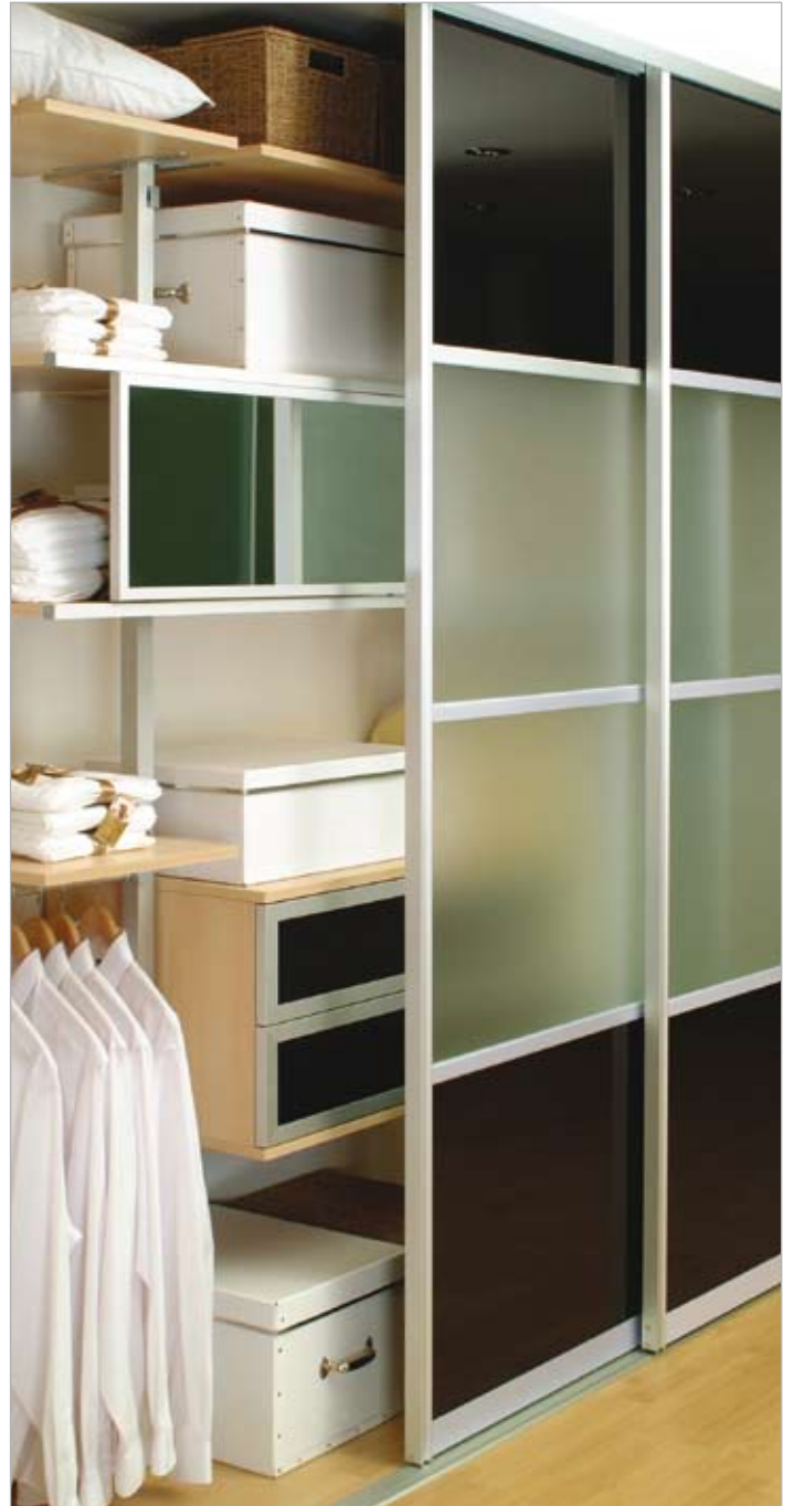
DRESSING ROOM Sliding doors in MATELUX Clear and LACOBEL Classic Black (Commonfield Contemporary Doors).