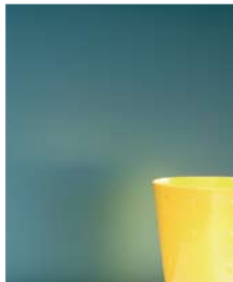
Matelux Stopsol Supersilver dry.