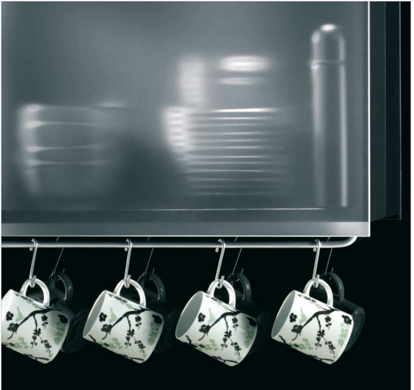
KITCHEN A glass-fronted kitchen cupboard in MATELUX Clear and splashback made of black LACOBEL (painted glass) provide a sophisticated contrast with a modern feel.