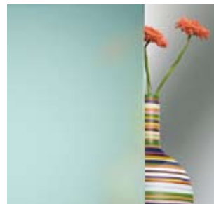
Stopsol Supersilver Green