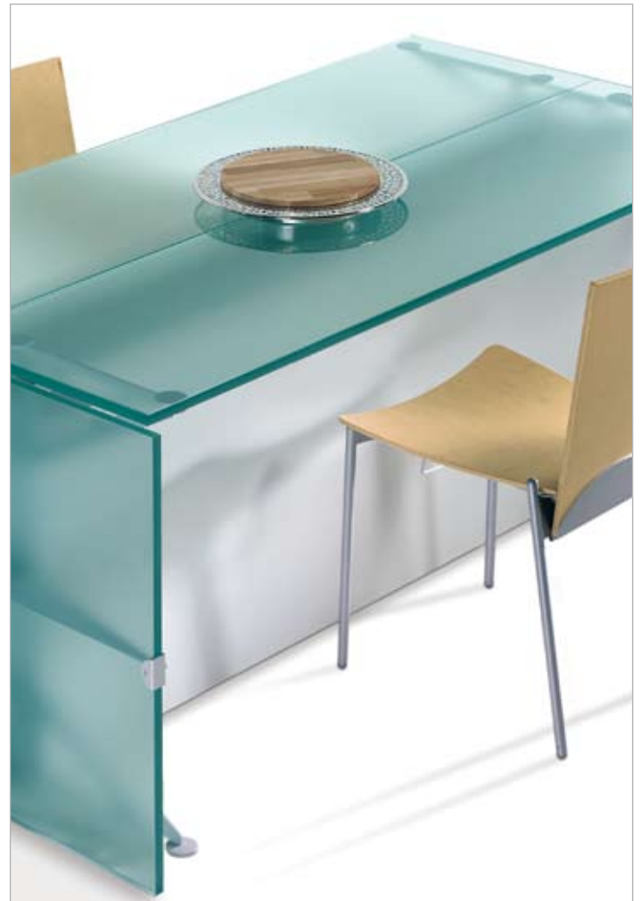
An office table made of 15-mm thick MATELUX Linea Azzurra.